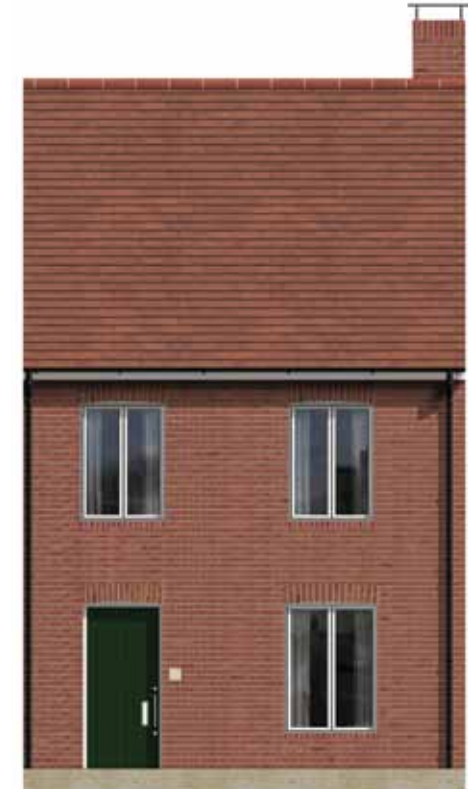
Plot 35, 37

Please note floor plans featured throughout this booklet for Roussillon Park are for general guidance only and are not to scale & should not be relied upon for the purchase of carpets or furnishings. Room dimensions are based on design drawings and are approximate only. ZeroC give notice that particulars including text, photographs, CGI images and floor plans are for guidance only and must not be relied upon as a statement of fact. Floorplans shown throughout this booklet are NOT to scale, in proportion to each other, or to the built form.