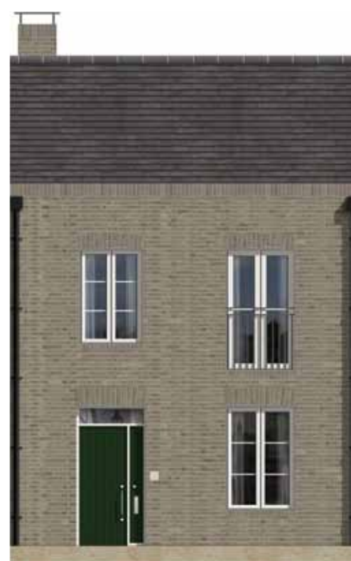
Plot 5, 7, 9